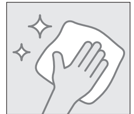
Clean window thoroughly with cloth and allow to fully dry.

Clean the area where you want to place your decal. For best results, use products that won't leave behind residue or fibers, like paper towels. Use glass cleaners or rubbing alcohol with a microfiber cloth, chamois, coffee filters, etc, if you have these options available. Allow area to fully dry.