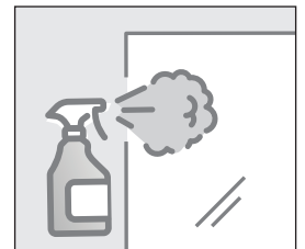
Spray the window and the face of the decal with application fluid.

Using your spray bottle & application fluid, thoroughly wet the surface evenly where the you'll be placing the decal.